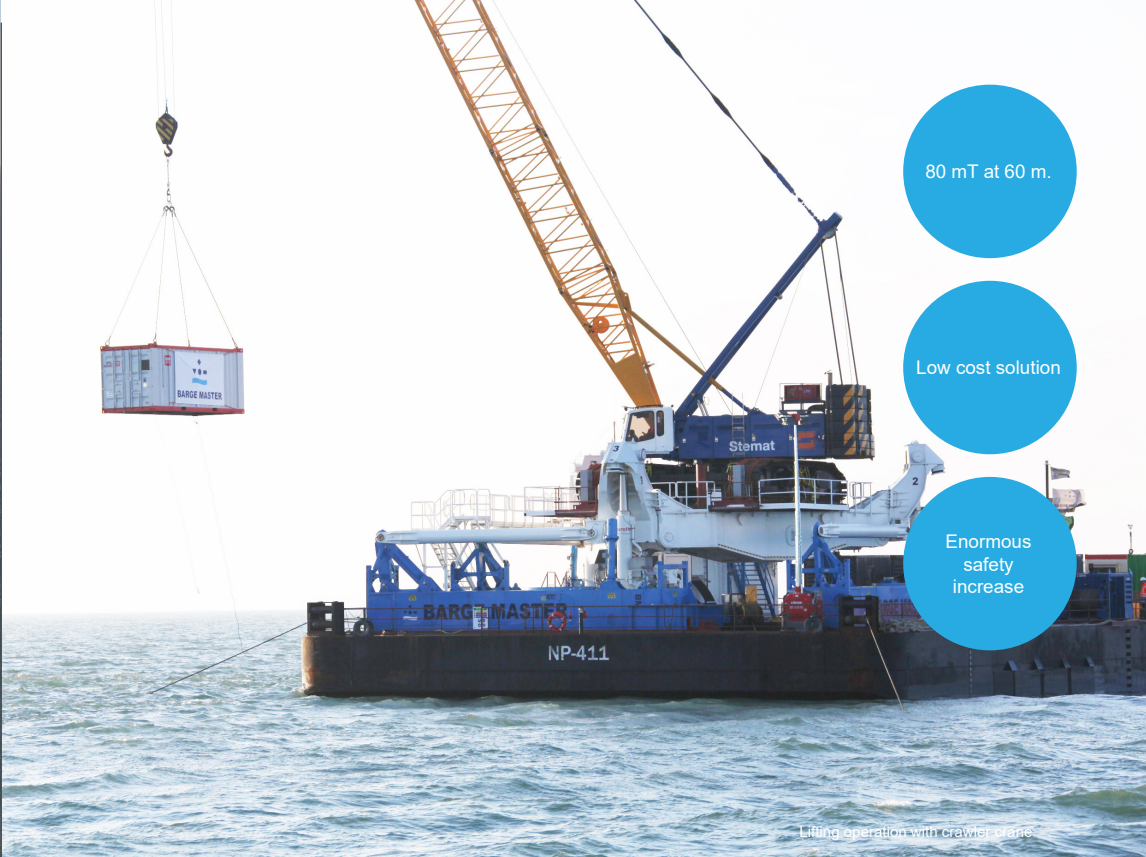
Lifting operation with crawler crane

The platform is also equipped with an unique "on-board lifting" functionality, which allows the crane to safely lift the load from the vessel's deck. This prevents clashes between the load and the vessel and increases safety for deck personnel as well as protecting the load.